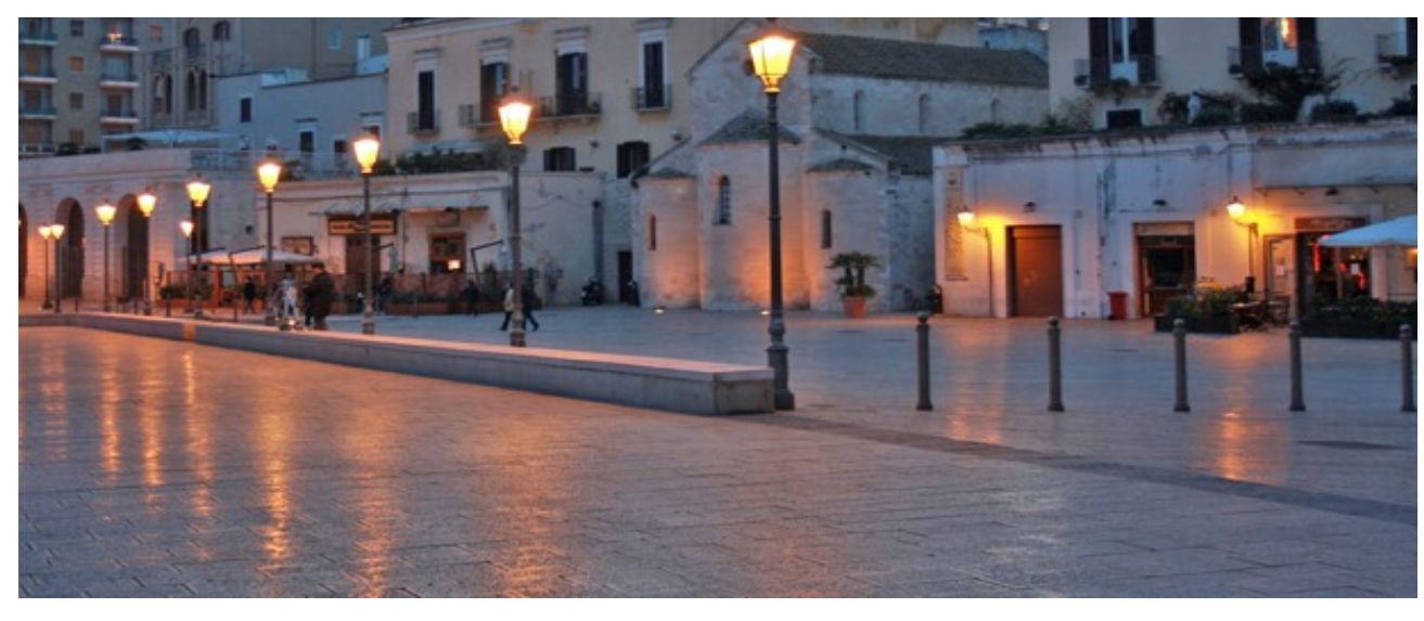
The panoramic view of the church