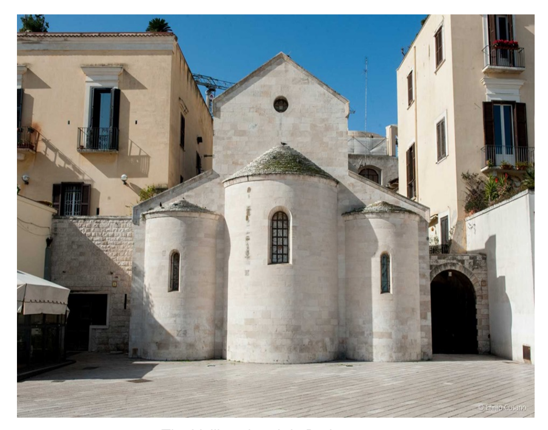
The Vallisa church in Bari