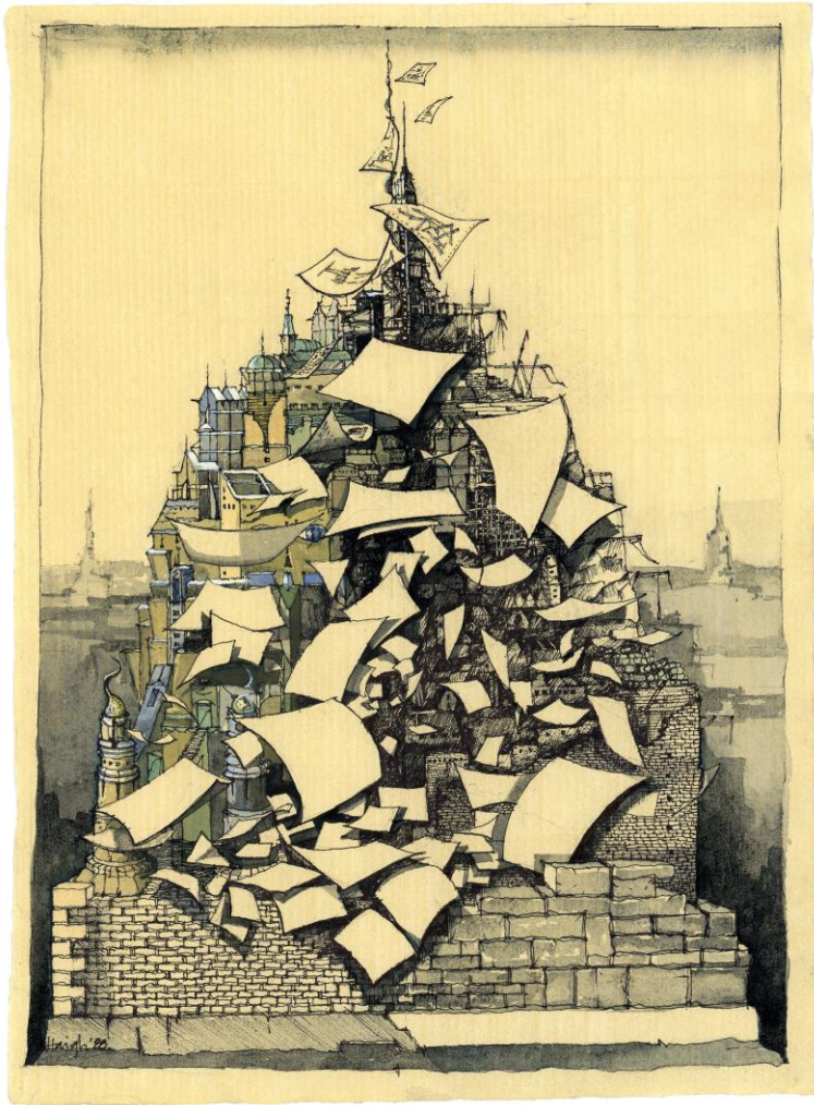
Cities and Eyes # 5 – Moriana, 24,4 x 33, Pen, Ink, Watercolor on Fabriano Paper, 1988